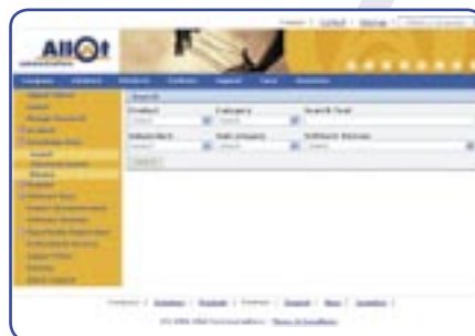
Powerful search engine to find information in the extensive technical knowledge base