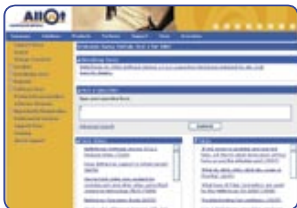
Allot Support Home Page - introducing a wealth of information to support Allot equipment

Allot's customer care services are provided through Platinum and Gold Maintenance and Support Contracts which offer optimal, 24/7 customer service, guaranteeing your hardware, firmware and software at all times.