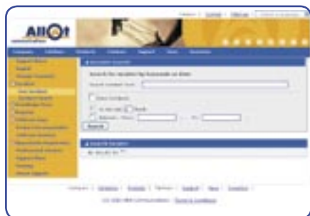
Easy search facility to record, locate and track incidents